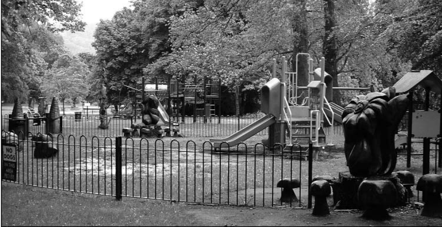
Play area: A new combination unit for under 5s has been provided

extra grass cuts during the year. Residents will have seen the effect of flowerbeds and properly tended lawns at the Whitworth Road, Parkway, and Greenaway Lane junctions with the A6. The Town Council believes that these have been a good investment, and are very keen for their continued upkeep. We are also looking at other areas in the town where such facilities would be attractive, and suggestions would be very welcome. The Town Council employs a Village Warden, whose duties include maintenance of footpaths and supplementing the litter collections that are the responsibility of the District Council.